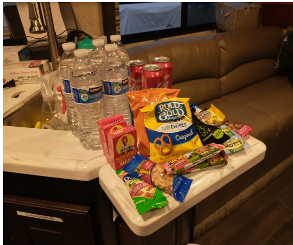
Welcome Center "snack table"

AIDNW office : 1915 S Sheridan Ave Tacoma, WA 98405 253-572-9659