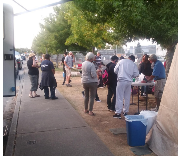
August 3rd: 59 released! A new record for AIDNW

Ready for onward travel! Thank you AIDNW volunteer drivers! Two or more volunteer drivers are scheduled to serve one night each week to drive guests to the bus station, airport or other local destinations. Others agree to be "on call" if needed.